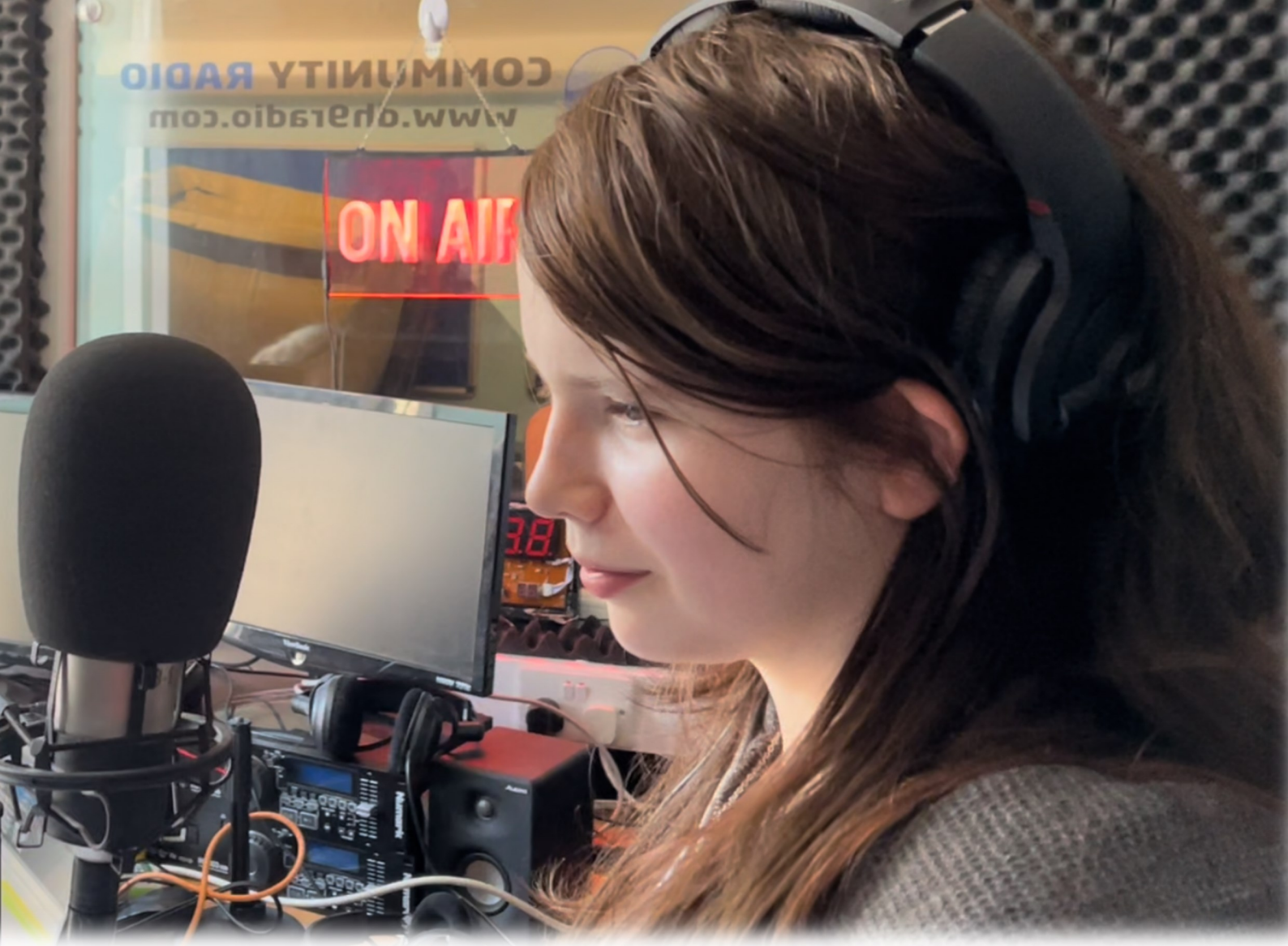
Recording original songs at PACT House, Stanley